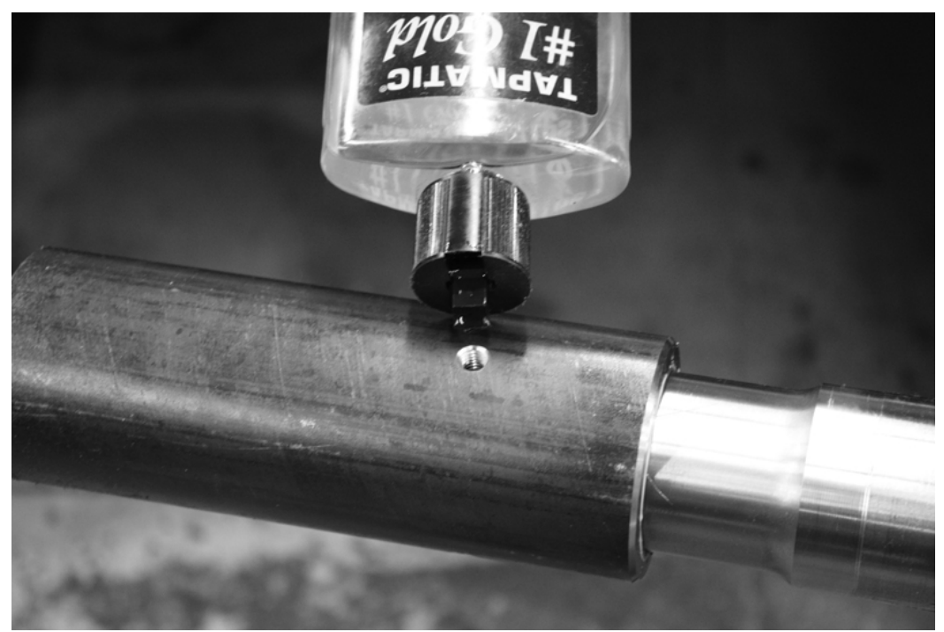
Apply a liberal amount of cutting fluid through the oiling port on the boring tool housing. You will need to add more fluid as you go. It is <u>VERY IMPORTANT</u> to add cutting fluid as necessary to make sure the cutting head has proper lubrication. FAILURE TO DO THIS WILL RESULT IN PERMANENT DAMAGE TO BOTH THE BORING TOOL AND YOUR HOUSING.