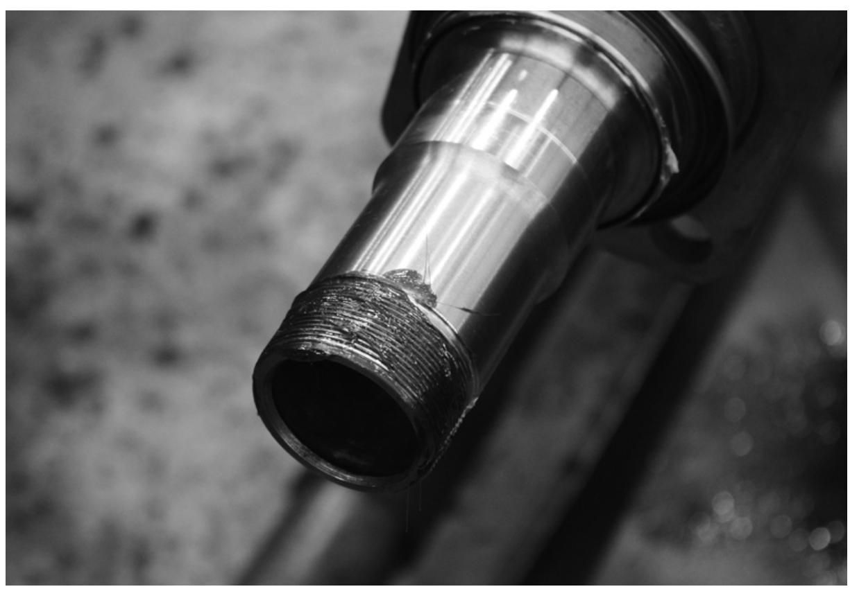
Apply a liberal amount of bearing grease to the spindle threads.