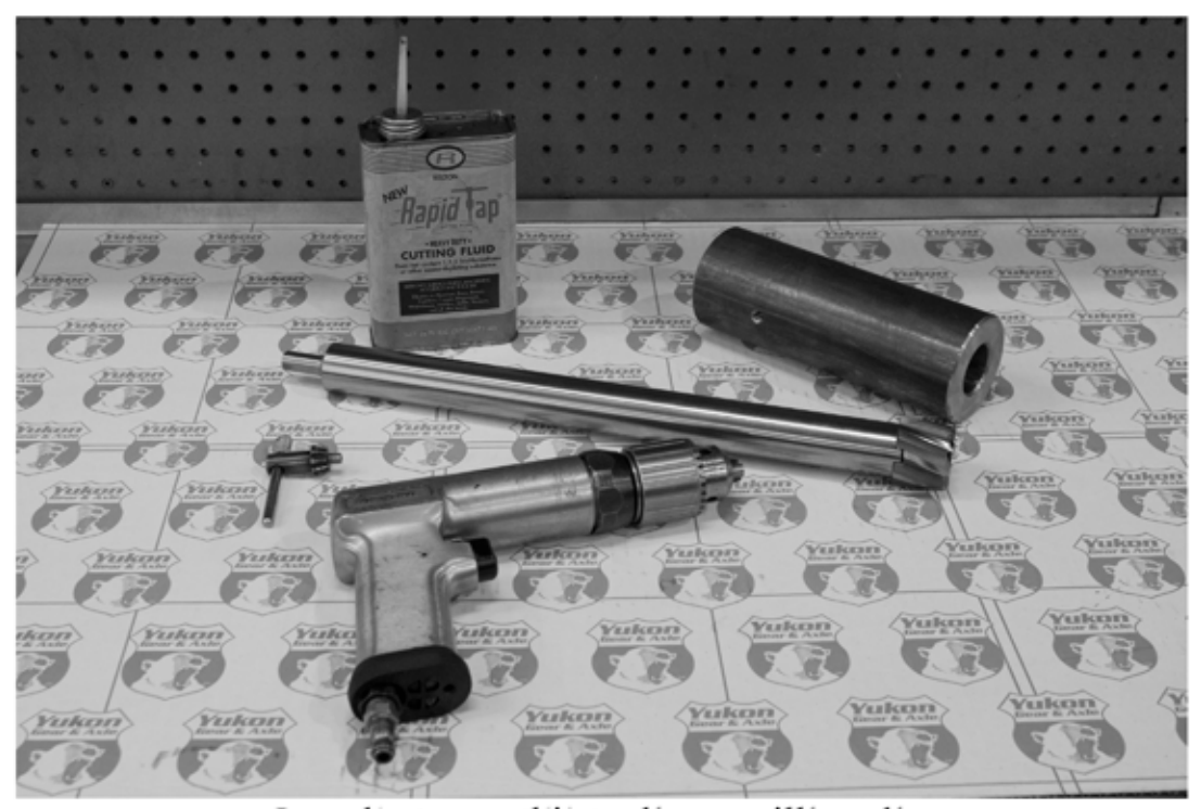
In order to use this tool, you will need: