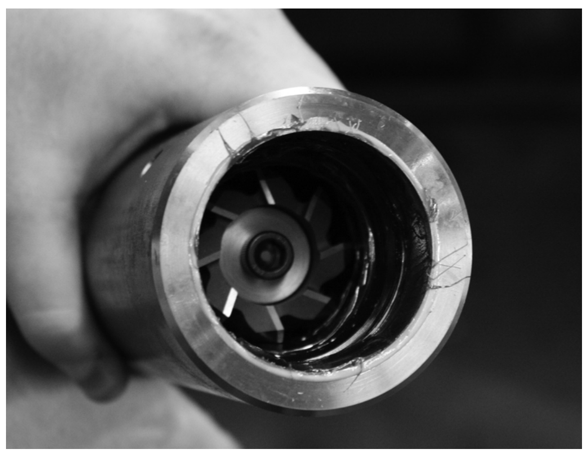
Slide the cutting head/boring shaft into the boring tool housing.