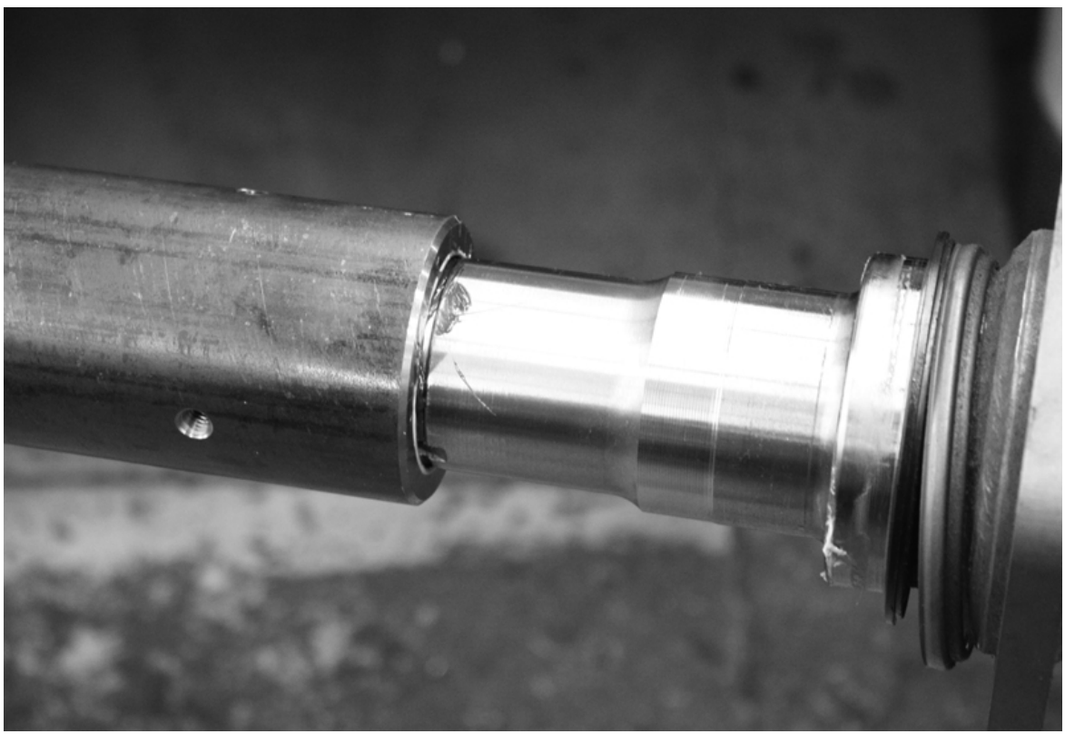
<u>CAREFULLY</u> thread the boring tool onto the spindle. Be sure that you have enough grease on both the boring tool and the housing. Thread the tool on <u>slowly</u> as to not damage the threads.